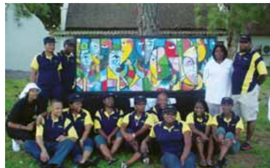
The PSETA employees at a team building workshop seen here working together in artistic endeavour and proudly displaying the fruits of their labour.